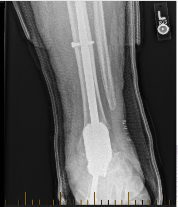
6-month post-op images showing bony union and a stable construct.