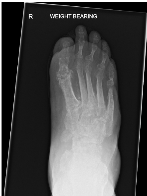
Figure 7 5 months post first stage revision - AP radiograph