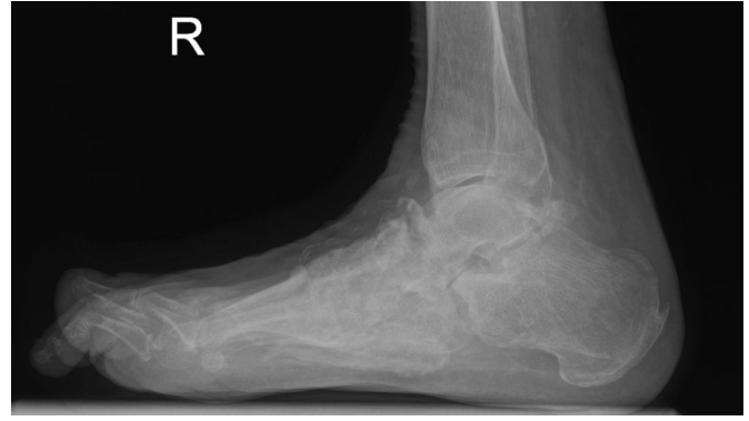
Figure 6 6 weeks post first stage revision - Lateral radiograph