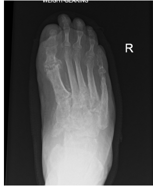
Figure 5 6 weeks post first stage revision - AP radiograph