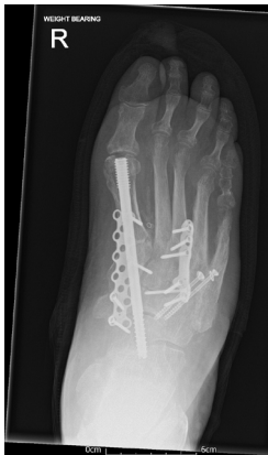
Figure 1 Post-op - AP radiograph

3 months after reconstruction, the patient presented with dehiscence of medial surgical wound with radiological evidence of midfoot osteomyelitis. A 2-staged reconstruction was planned.