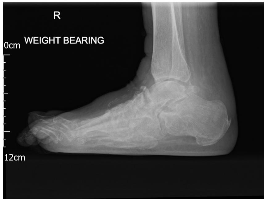
Figure 8 5 months post first stage revision - Lateral radiograph