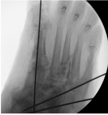
Figure 4 Intra-op first stage revision with CERAMENT® G