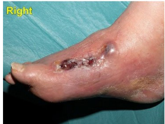
Figure 3 Post-op - right foot infection medial wound